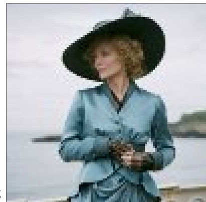
Michelle Pfeifer in Cheri on 12th December at the Triangle

I'd just like to take this opportunity to thank all of the volunteers who have been involved in the Cinema nights this year for all of their hard work and enthusiasm and more importantly, time. Thank you also to all of our audience supporters, we hope to see you again in 2010.