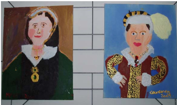
Two of the Tudor Portraits (after Holbein et al) by the children of the Triangle After School Club to mark the 500th anniversary of the accession of Henry VIII.