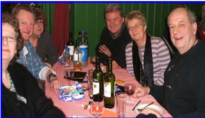
The victorious Liss Artists - winners of the 2010 Triangle Quiz held on 6th March

All this and more - helping with the After School Club, W2H Walk Leaders - what a team! We shall miss them now that after 13 odd years they have decided to take a back seat. They are the epitome of what volunteering is all about.